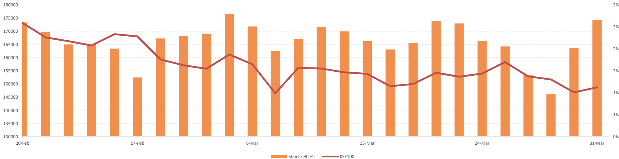
KSE-100 VS % Short Sell Of Total Open Interest